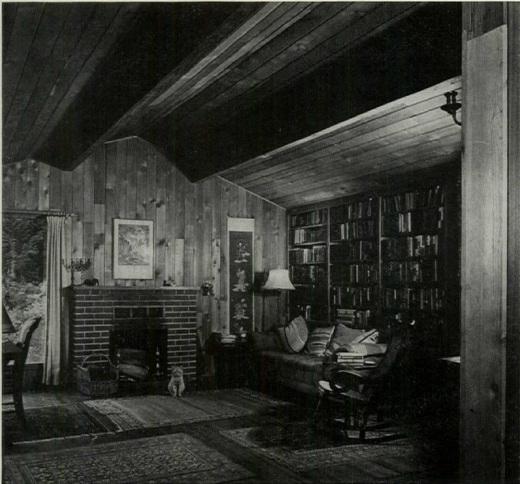
THE CEILING BEAMS running the length of the room avoid the clutter of an A-framing system.