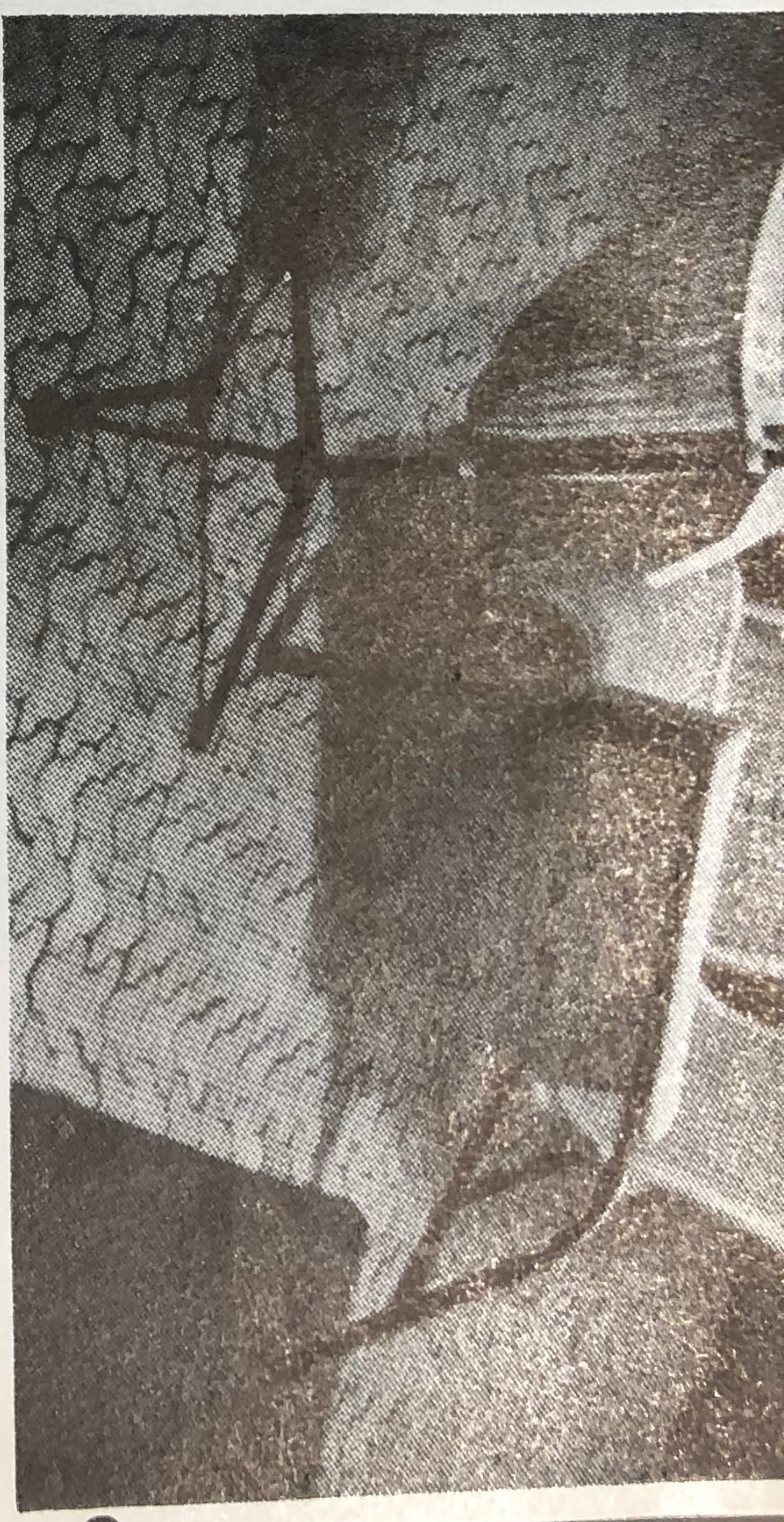
Left: Domus, No. 252-53, Milan. This striking antedeluvian skeleton of a molded plywood dining set, by Molino, typifies many Italian tables and chairs from the postwar production lines to be seen in this issue.