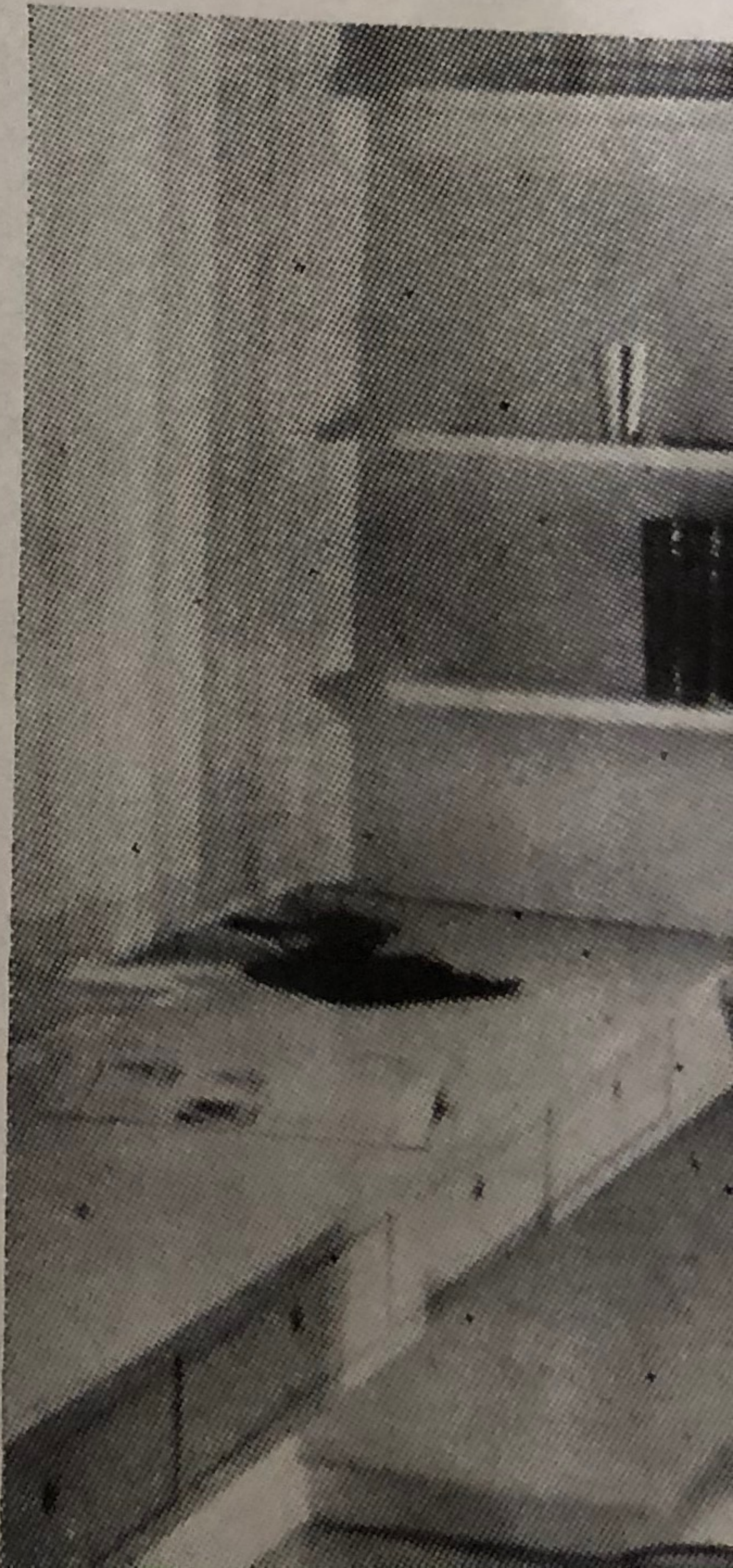
Above: Archi Stuttgart. Ov belonging to a furniture puz together. By I