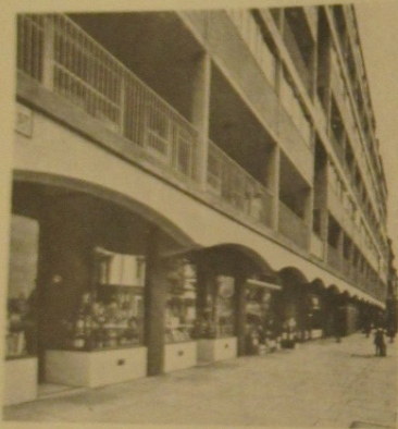
Above: Architectural Design, August, London. Flats by Powell & Moya in Pimlico, London, completed this year, are thoroughly reviewed in 18 pages. Shopping street shown here.