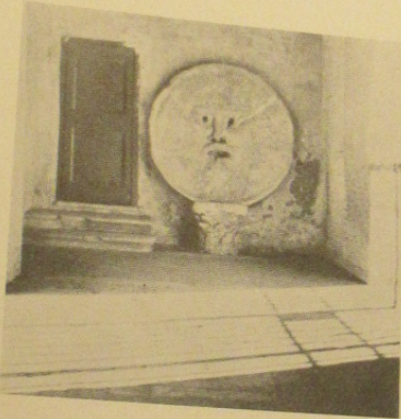
Above: The Ambassador, September, London. The editors take a 26-page trip to the Medi- terranean, show the mask of a Triton in Cosmedin among many exciting photographs.