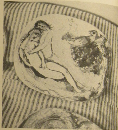
Above: Werk, July, Zurich. Ceramics by Marc Chagall and paintings by Ferdinand Hodler follow a well-photographed collection of schools in Yugoslavia, Italy, and Germany.