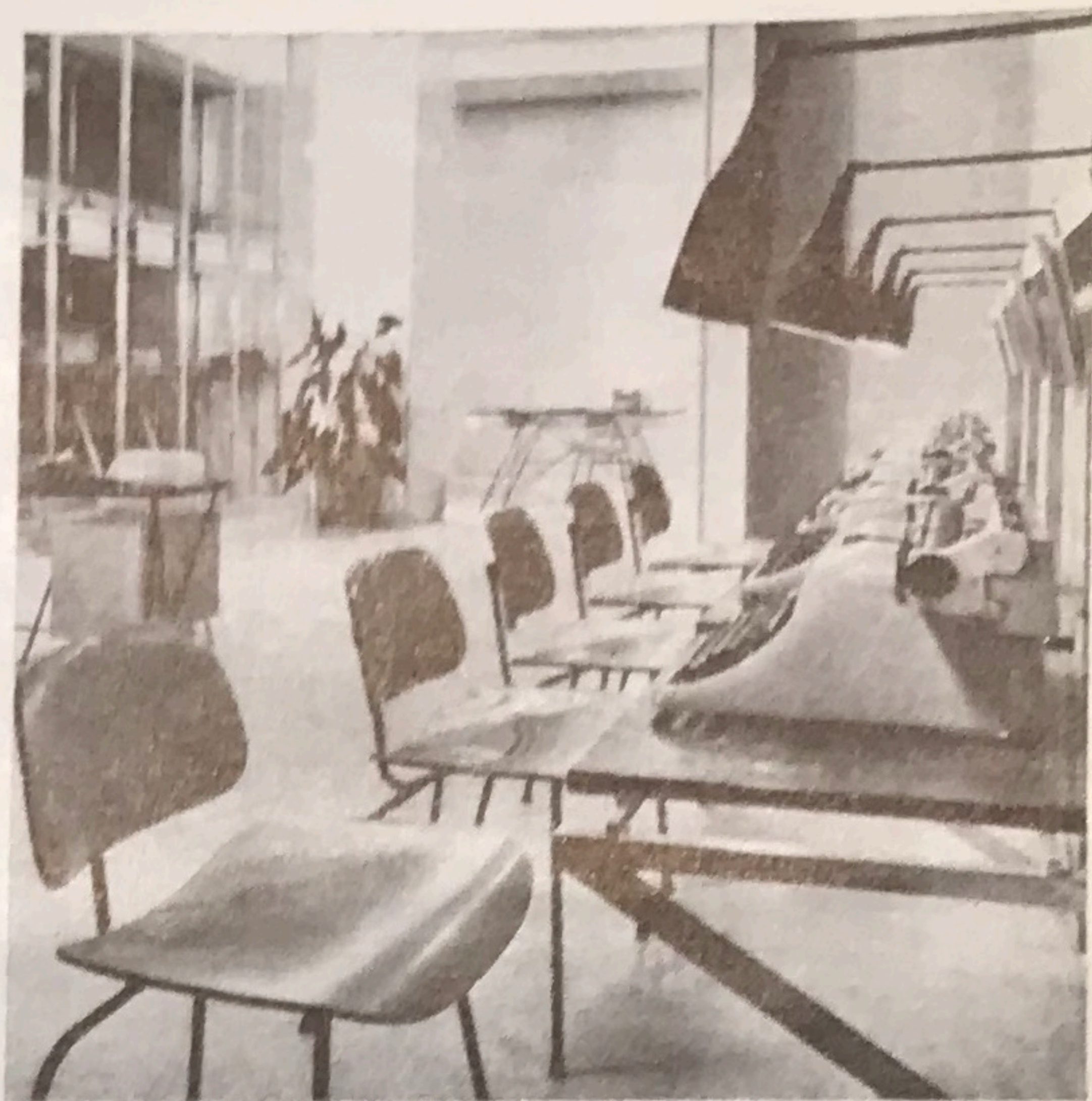
Above: L'ARCHITECTURE D'AUJOURD'HUI, No. 90. In issue on Brazil completely documenting Brasilia, are also an Olivetti office and showroom. The latter, illustrated, is by architect Giancarlo Palanti. Marble tables attached to metal posts serve as demonstration tables inside, and as window display stands at glass street wall (left background in photograph).

MOEBEL DECORATION, 9 1/2" x 12 1/4", averaging 125 pages, printed monthly in Stuttgart, Germany, concentrates on the interior merchandise of Western Europe and Scandinavia. Text and captions in triplicate—German, French, and English. In the U. S. through Wittenborn & Company, N. Y., $9.00 annually.