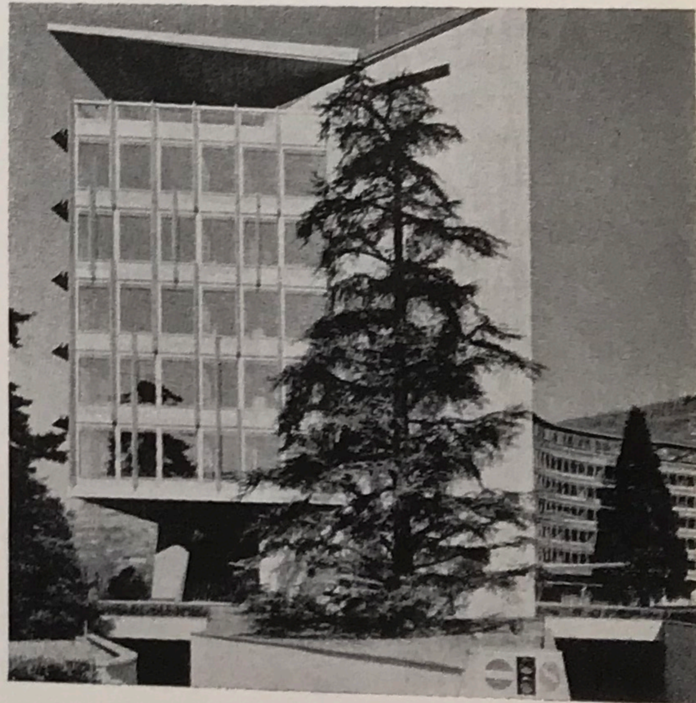
Above: L'ARCHITECTURE D'AUJOURD'HUI No. 89. Administration building for Nestlé Chocolate Company in Vevey, Switzerland by Jean Tschumi—one of many interesting modern buildings in an issue on contemporary architecture in the world. L'ARCHITECTURE D'AUJOURD'HUI, 9" x 12 1/4", averaging 180 pages, on glossy stock, edited in Paris by Andre Bloc, is a crowded, professional, matter-of-fact magazine published six times a year. It offers a more complete international coverage of architecture than any other single publication in the world. No translation of the French text. A. de Mendelsohn, 403 East 48th Street, New York 22, or Wittenborn & Co., $16 a year.

MOEBEL DECORATION, 9 1/2" x 12 1/4", about 125 pages, printed monthly in Stuttgart, concentrates on interior furnishings in Western Europe and Scandinavia. Text and captions in triplicate — German, French, and English. Available through Wittenborn & Company, $9 a year.