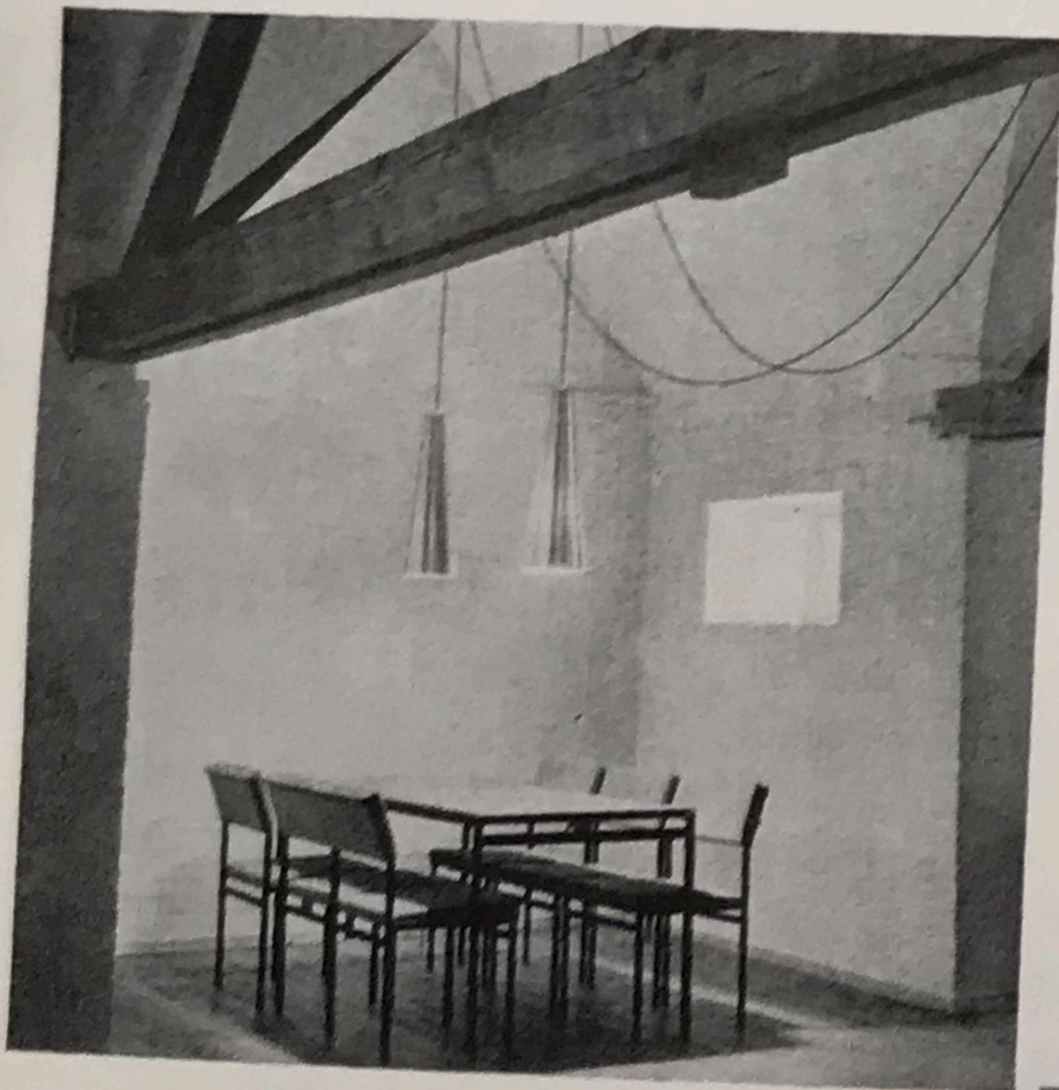
Above: MOEBEL DECORATION, September 1960. Dining set in furniture showroom created in old storage building belonging to Belform factory, Maline, Belgium, by architect Alfred Hendrickx.

MOEBEL DECORATION, 9 1/2" x 12 1/4", about 125 pages, printed monthly in Stuttgart, concentrates on interior furnishings in Western Europe and Scandinavia. Text and captions in triplicate — German, French, and English. Available through Wittenborn & Company, $9 a year.