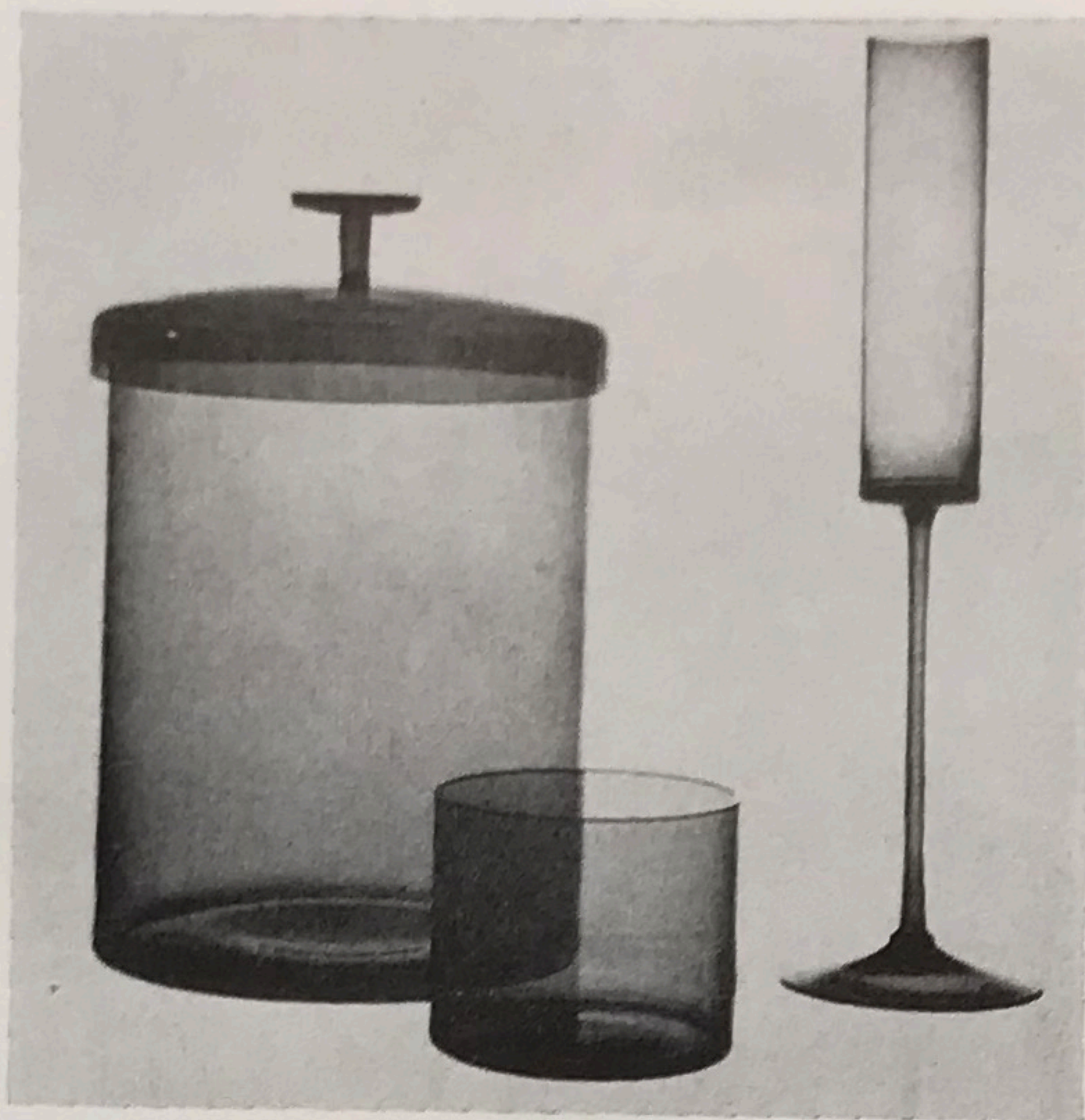
Below: CUADERNOS DE ARQUITECTURA, No. 40. Waiting room in health insurance building reveals modern interiors and well-integrated works of art. By J. M. Martorell and Oriol Bohigas, architects. CUADERNOS DE ARQUITECTURA, 9 1/2" x 13", averaging 70 pages, published 4 times a year. Though the official organ of Colegio Oficial de Arquitectura de Cataluña y Baleares, also ventures into such subjects as pre-Raphaelite painting, modern art. English and French resumes of Spanish text. At present obtainable only by direct subscription: Single copies 80 pesetas, annual subscription 320 pesetas. Avenida Jose Antonio Primo de Rivera, 563, bajos, Barcelona (11) Spain.