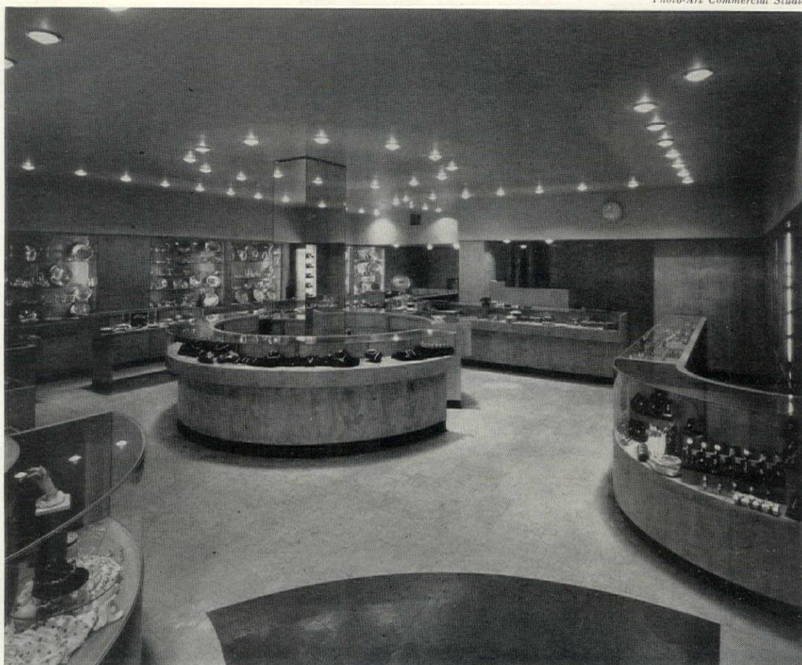
SEVERAL SCORE CEILING SOURCES BRING OUT SPARKLE OF DIAMONDS AND SILVER IN CASES