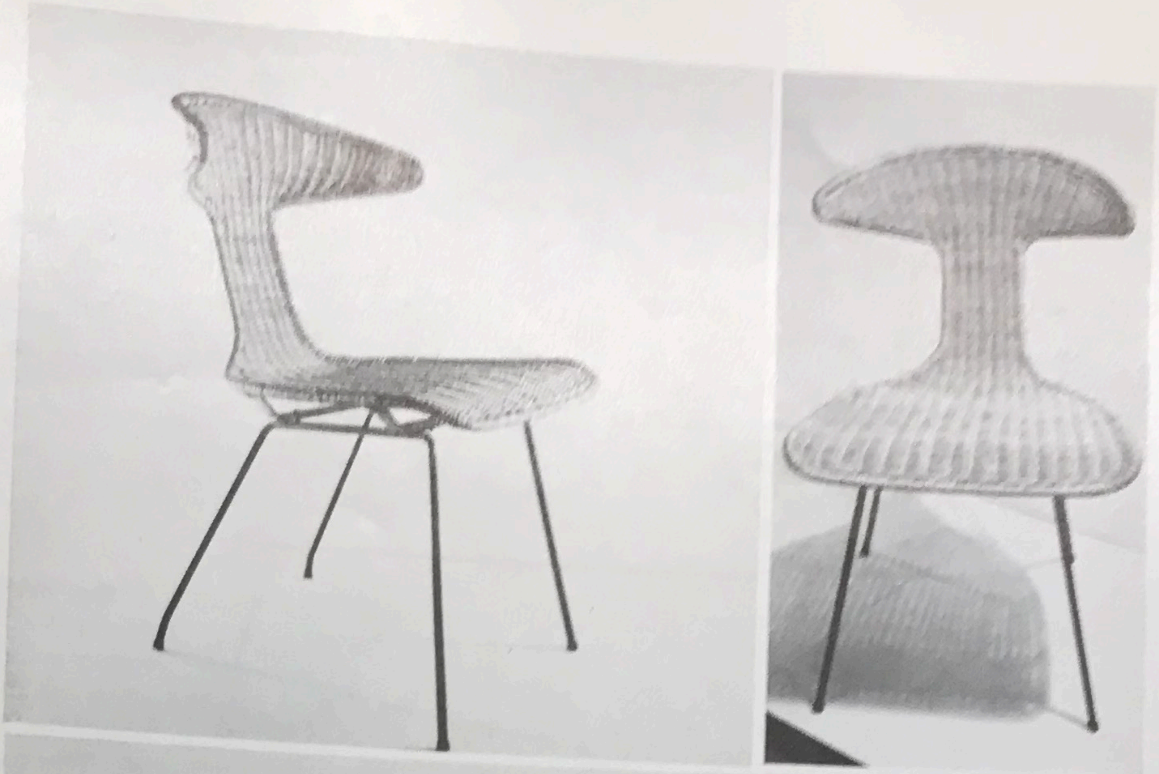
Cockfight chair, above, sets a slim-waisted seat on wrought iron base, at $57.50.